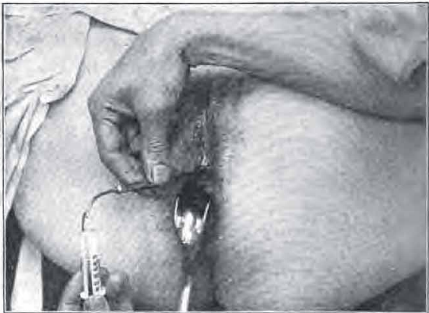
FIG. 8.—The catheter introduced into the left ureter. The direction of the catheter is well shown. The catheter has been assisted by the finger in the rectum, over the brim of the superior strait. The urine as it discharges is collected in the minim graduate for qualitative and quantitative examination.

the urine into the catheter, would frequently catch and cut the mucous membrane of the urethra as it was being carried into the bladder; I have replaced this in my own instrument by several perforations in a little gutter countersunk on the concave side of the shaft near the point of the instrument. The opposite end of the catheter at the handle is provided with a lip curving downward to facilitate the discharge and collection of the urine in a finely graduated tube. During the introduction of the catheter this end of the tube is plugged