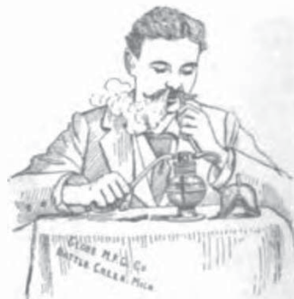
METHOD NO. 7.