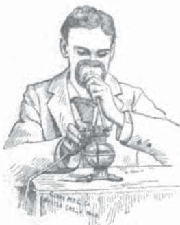
METHOD NO. 1