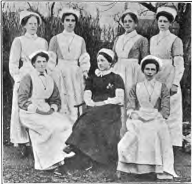
A GROUP OF ENGLISH MIDWIVES