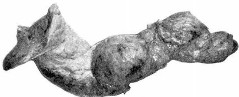
FIG. 5.—Characteristic corkscrew appearance of tumor.

the vagina. Fig. 6 represents the mass or tumor twisted into its original shape, but showing the spiral line of incision. The tumor was five inches in diameter at its greatest width and six inches in length, completely filling the bony pelvis. A portion