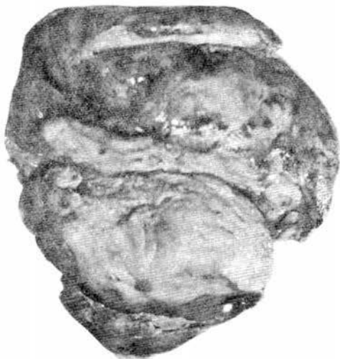
FIG. 6.—Tumor twisted into its original shape, showing spiral incision.

The operation was done under nitrous oxide and oxygen gas and the tumor removed in six minutes, after which two large