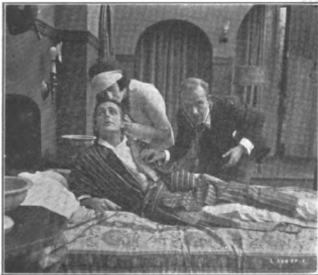
The doctor is looking in the wrong direction to discover why Wallie Reid is registering a heart-beat of 210 to the minute.