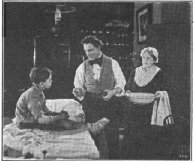
John Barrymore in "Dr. Jekyll and Mr. Hyde." We don't blame son for looking doubtful. The doctor appears to be prescribing three pills twice daily for a sprained ankle.