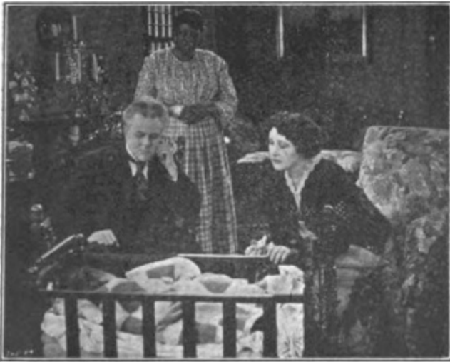
Baby dying in "The Sins of Rosanne." That's what the doctor is thinking so hard about.